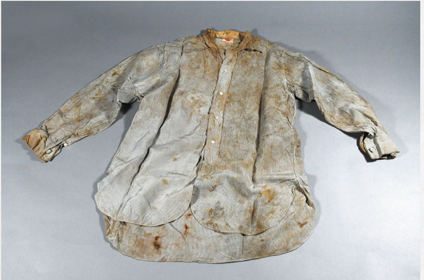
Shirt that a father put on his severely burned son