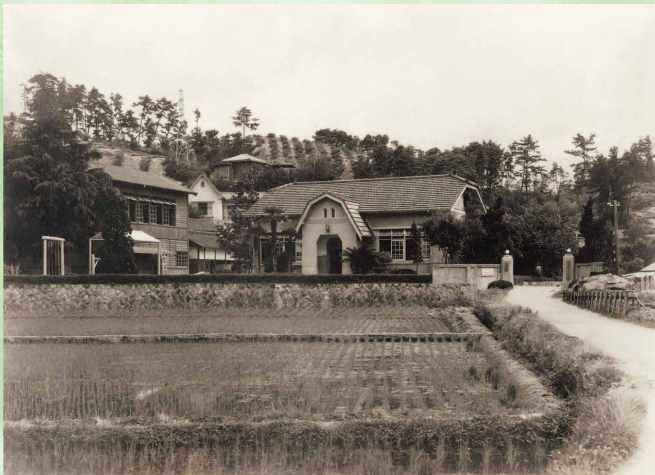
Hiroshima War Orphans Foster Home when it was initially established