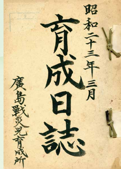
Daily log of the foster home