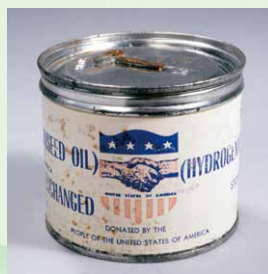
Relief supplies from the U.S. Donated by Ninoshima Gakuen