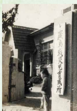
Nameplate on the foster home's gatepost