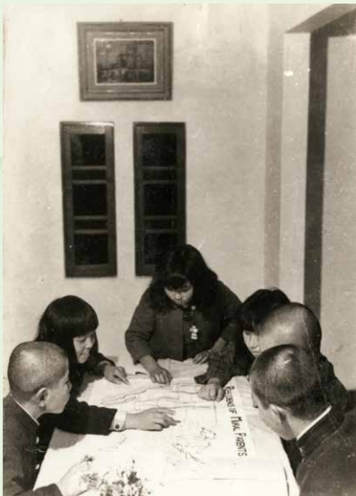
Children looking at the map of the U.S.