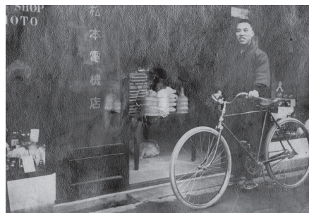
In front of Matsumoto Electric Appliance Store February 29, 1924 Sarugaku-cho

Townscapes before the Atomic Bombing/Townscapes Completely Changed/Steps Toward Recovery