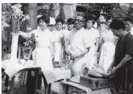
Commemorate service at Shima Hospital