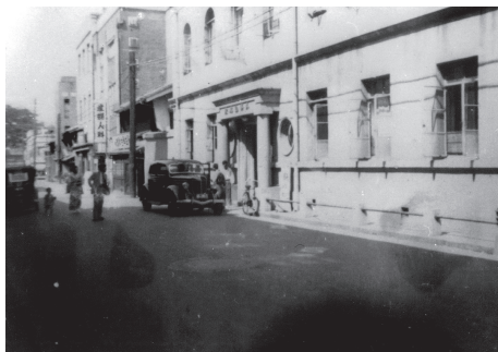
View of Shima Hospital from a street in Saiku-machi Around 1943 Saiku-machi