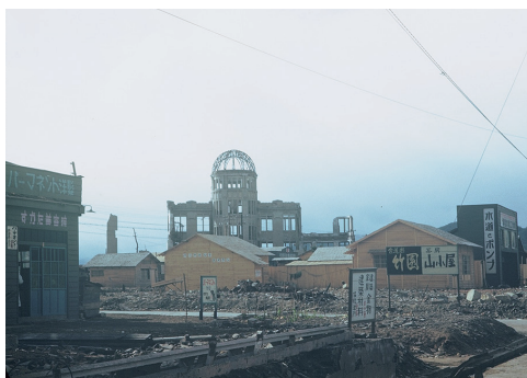
Houses that were built one after another Around 1946-1947 Sarugaku-cho