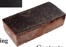
Brick exposed to the atomic bombing (Shima Hospital) Donated by Department of Geography, School of Science, Hiroshima University

In front of a hospital on the street, there is an explanation board of the hypocenter. It says that the atomic bomb exploded 600 meters above Shima Hospital, present-day Shima Internal Medicine. At the time of the atomic bombing, the Atomic Bomb Dome, located 160 meters northwest of the hospital, was known as the Hiroshima Prefectural Industrial Promotion Hall. The iron frame of the dome and parts of the wall that remain to this day are a testament to the devastation of the atomic bombing. Shima Hospital and the Hiroshima Prefectural Industrial Promotion Hall were respectively located in the areas called Saiku-machi and Sarugaku-cho.