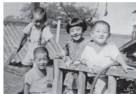
Children playing in the laundry drying area (Iseya Shop) August 29, 1944 Sarugaku-cho