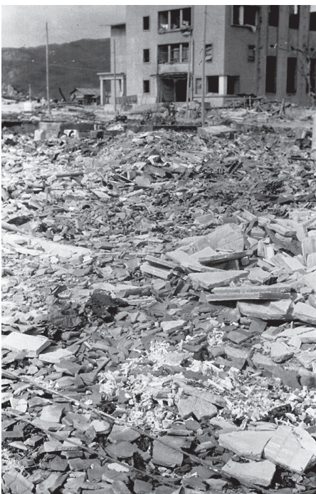
Ashes of the victims October 1-10, 1945 120 m from the hypocenter Sarugaku-cho