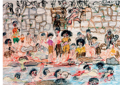
They used all the strength they had to get to the riverbed. Then they collapsed.

Naked, burned skin hanging in tatters—young and old, male and female alike, they came upon us in waves, cries of “I’m hot!” and “Help me!” merging into a huge wail.