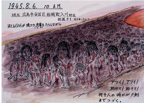
A scene of hell beyond our imagination met our eyes.

People fleeing, almost naked with their burned skin hanging. People walking in pitiful condition with severe injuries. People lying on the ground, just waiting for their death. These unearthly horrific scenes were often described as a “living hell.”