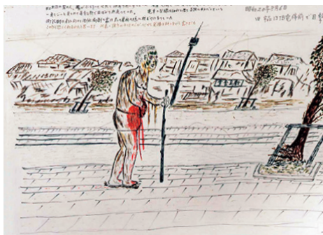
He was walking with his intestines dangling from his belly.

By and by, with death near, their weak voices strained to ask for water. When I gave it to them, they gulped it eagerly; relieved, they breathed their last breath.