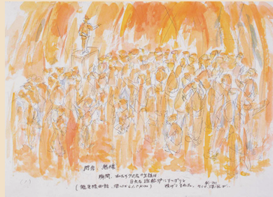
①Hiromu Morishita ②14→71 ③8/6 ④Tsurumi Bridge

I felt an intense pain as if I got a strong stroke of a wet whip.