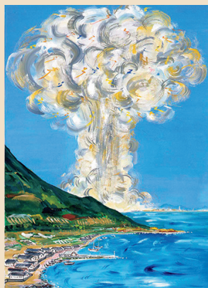
①Toshifumi Goto ②19→76 ③8/6 ④Ninoshima Island

An impetuous cloud of smoke rising into the sky. (I did not know anything about the atomic bomb and the mushroom cloud at that time.)