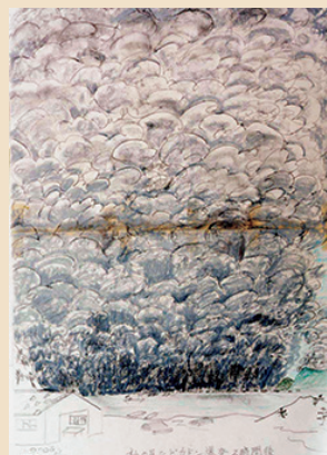
①Mutsuo Yanagimoto ②18→48 ③8/6 ④Kanawajima Island

Some sort of orange cloud or smoke was roiling upward and spreading out. The roof of the factory on the opposite bank of the river was blown away by the blast.