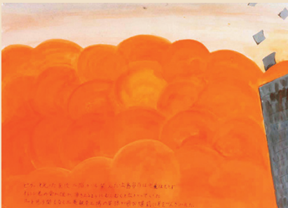
①Takako Tsujioka ②18→47 ③8/6 ④Kan-on shin-machi 4-chome

Some sort of orange cloud or smoke was roiling upward and spreading out. The roof of the factory on the opposite bank of the river was blown away by the blast.