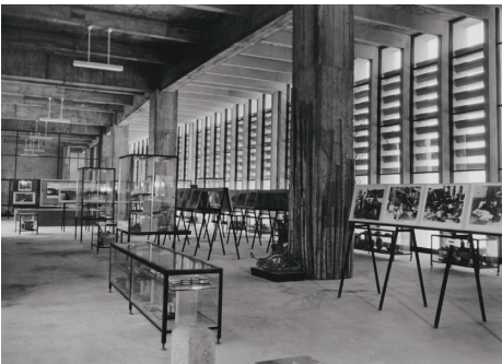
Exhibition room when the museum was opened 1955