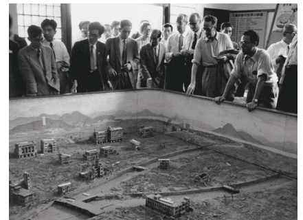
Panoramic model of Hiroshima City center after the atomic bombing that was set up in the Atomic Bomb Memorial Hall September 26, 1953