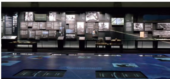
East Bldg. 3F The Dangers of Nuclear Weapons