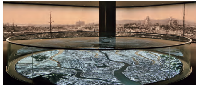
East Bldg. 3F Introductory Exhibit

*This exhibition contains exhibits that can be quite disturbing.