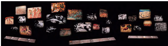
Main Bldg. Devastation on August 6